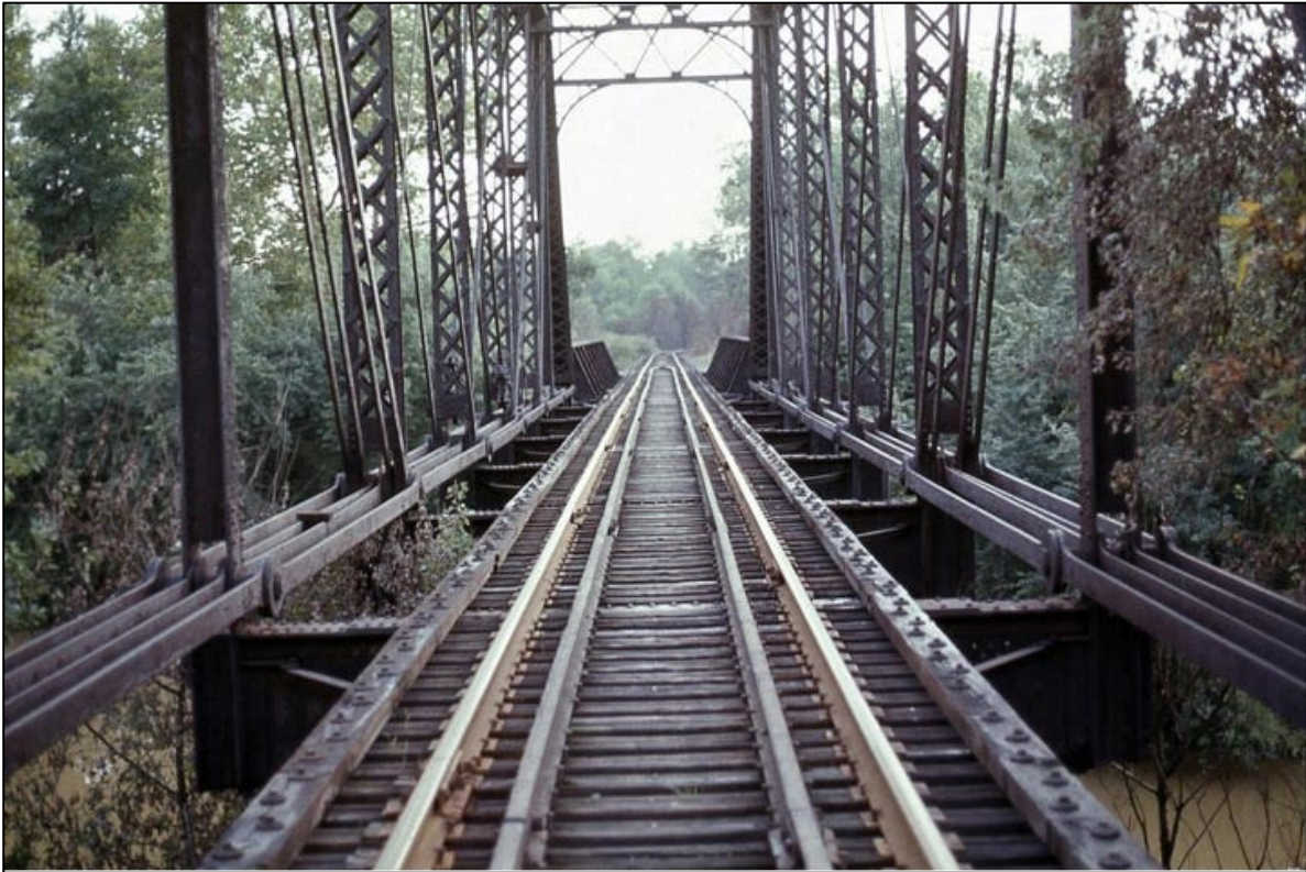
The Erie-Lackawanna Lisbon Branch bridge across the Mahoning River. March 1972.