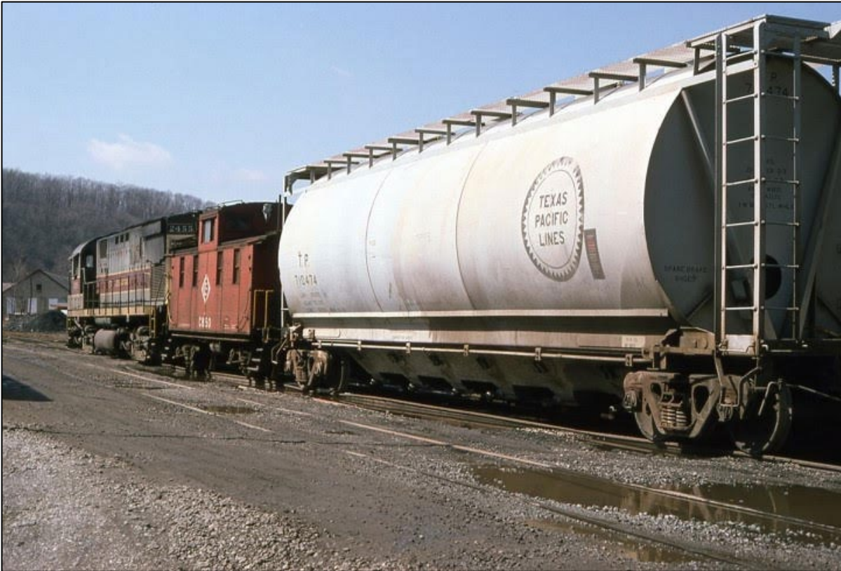
Erie-Lackawanna unit with a caboose and a covered hopper at Lisbon, Oh March 1976.