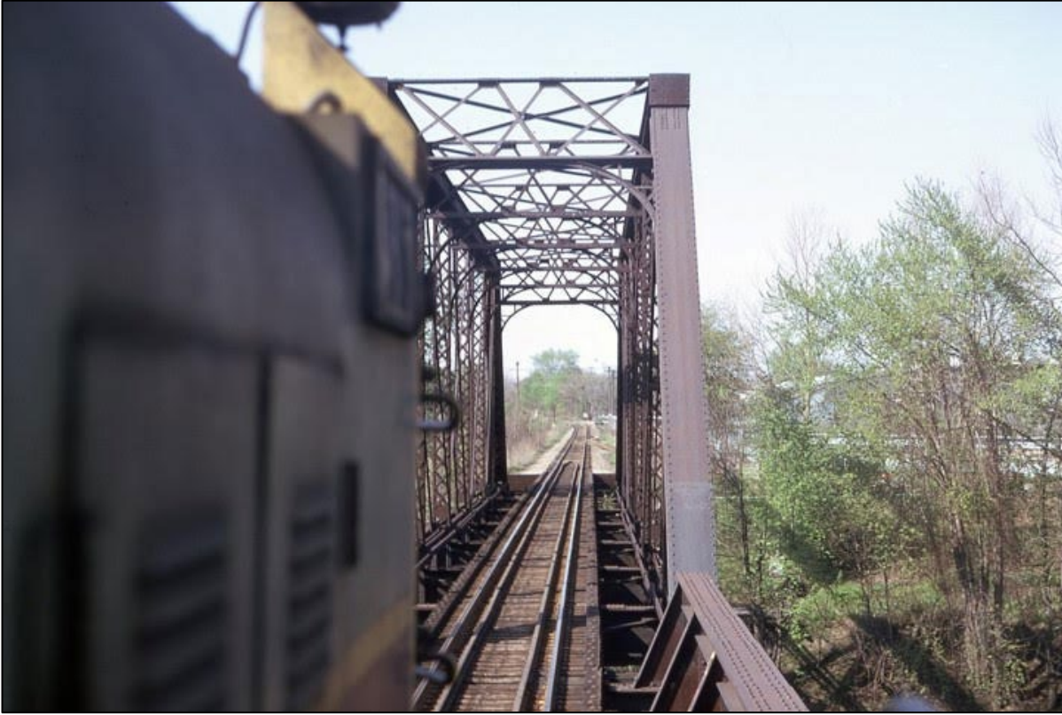
Crossing the Erie-Lackawanna Mahoning River bridge going northbound. Niles, Oh. May 1974.