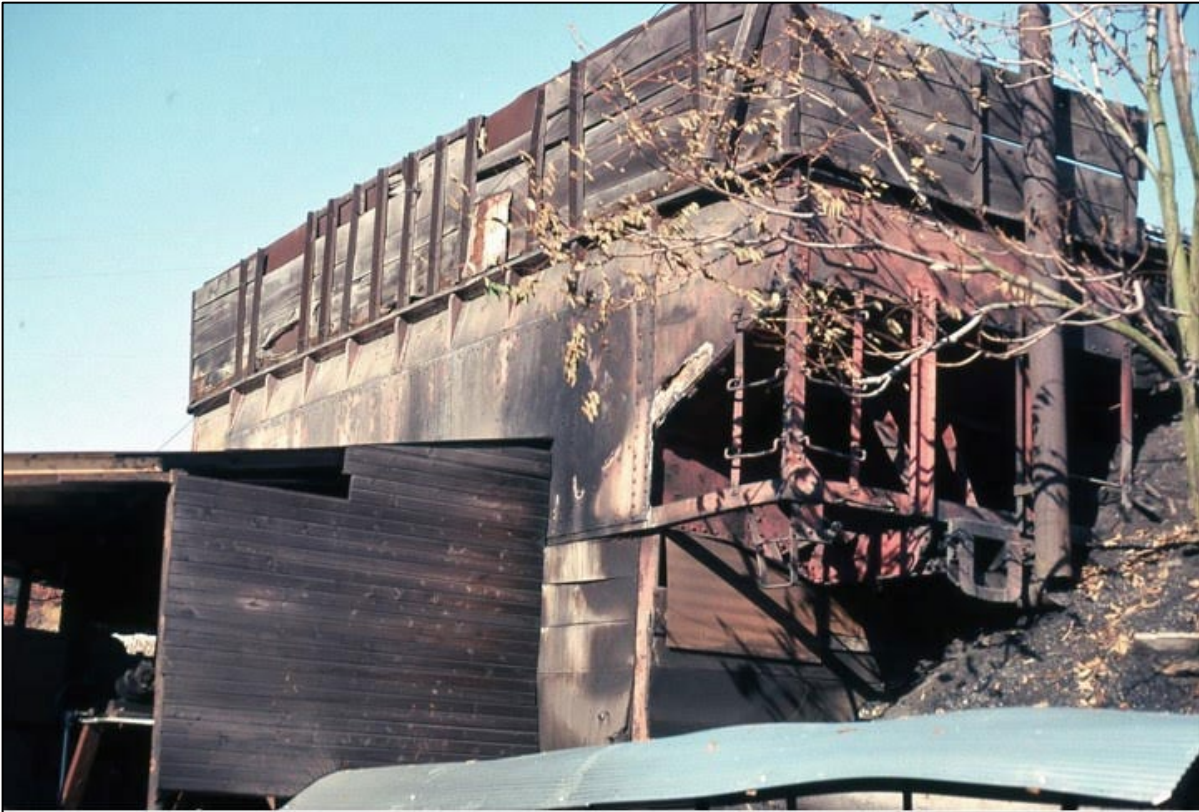
This is the homebuilt loader at Lisbon. October 1974.