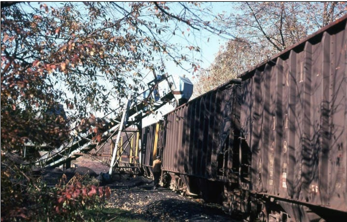
The coal from the loaded dumper car fell onto a conveyer belt and was loaded into the hoppers. Lisbon, Oh. October 1974.