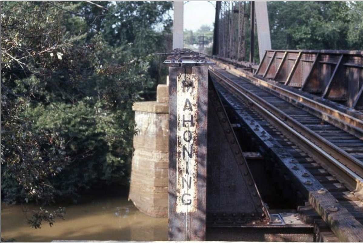
Erie-Lackawanna Lisbon Branch over the Mahoning River at Niles Oh. March 1972.