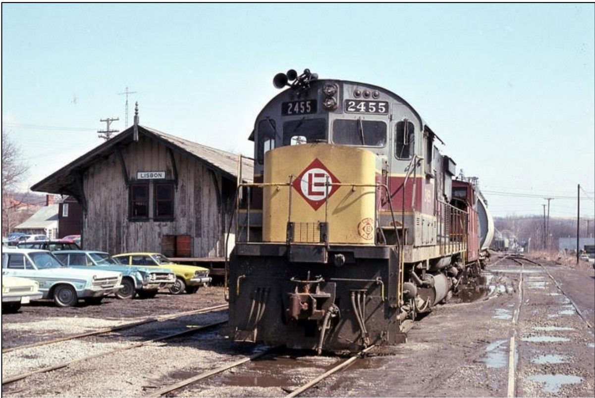
Erie-Lackawanna unit with a short train at Lisbon, Oh. March 1976.