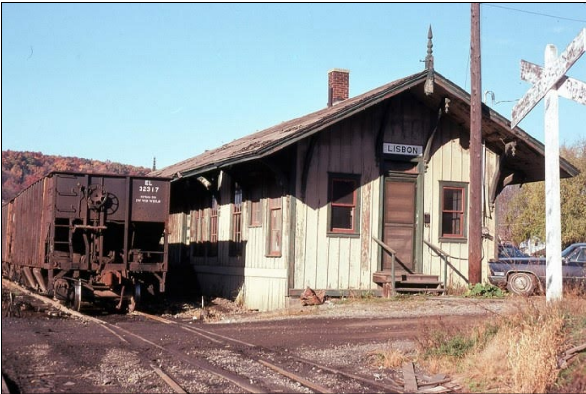
Another view of Lisbon Station with empty hoppers. October 1974.