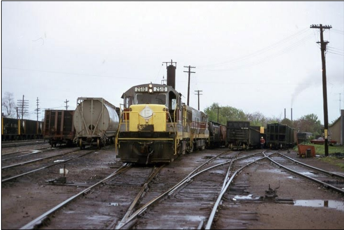
A loaded coal train from Lisbon has pulled into the Niles, Oh. Yard. May 1974.