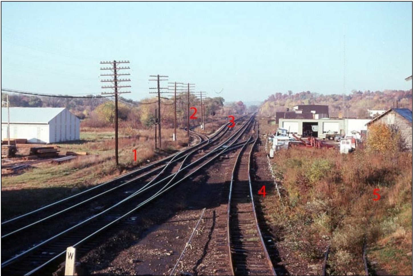
The Lisbon Branch is crossing the Penn Central main line in Leetonia, Oh. The branch goes off to the left. October 1974.