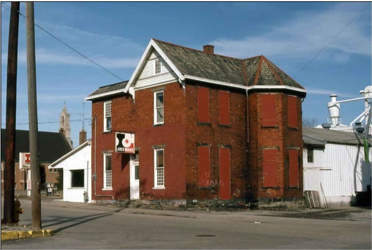
This is the P&LW Station in Lisbon. It has been restored and is used as the bikeway rest stop. END OF PHOTOS