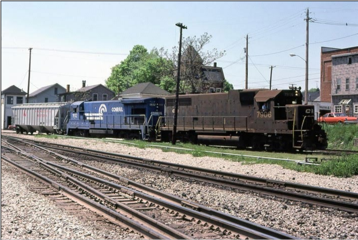
Two Conrail units are delivering a covered hopper to a grain dealer in Washingtonville, Oh. Photo location is at Leetonia, Oh.