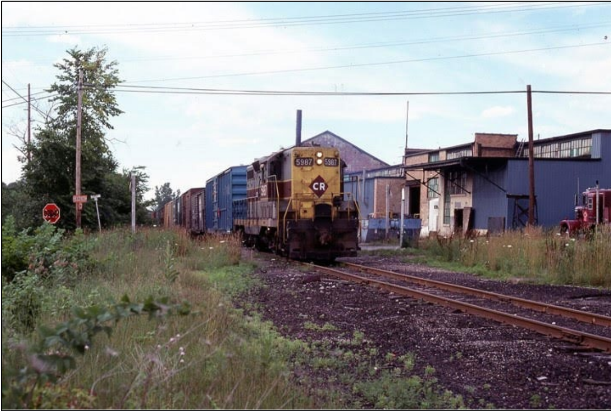
A Conrail unit is crossing Depot St in Mineral Ridge, Oh. heading south. The train is taking the cars to a food warehouse in Austintown, Oh. July 1978.