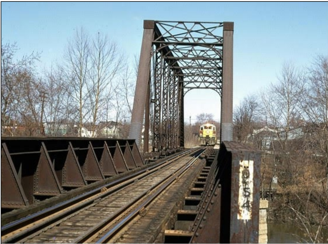
A southbound Erie Lackawanna train is about to cross the Mahoning River using the Lisbon Branch at Niles Oh. March 1972.