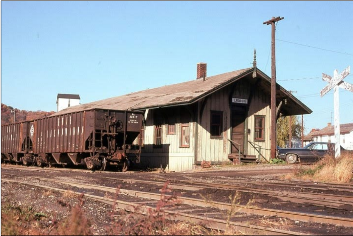
A view of the Lisbon Station with empty hoppers. October 1974.