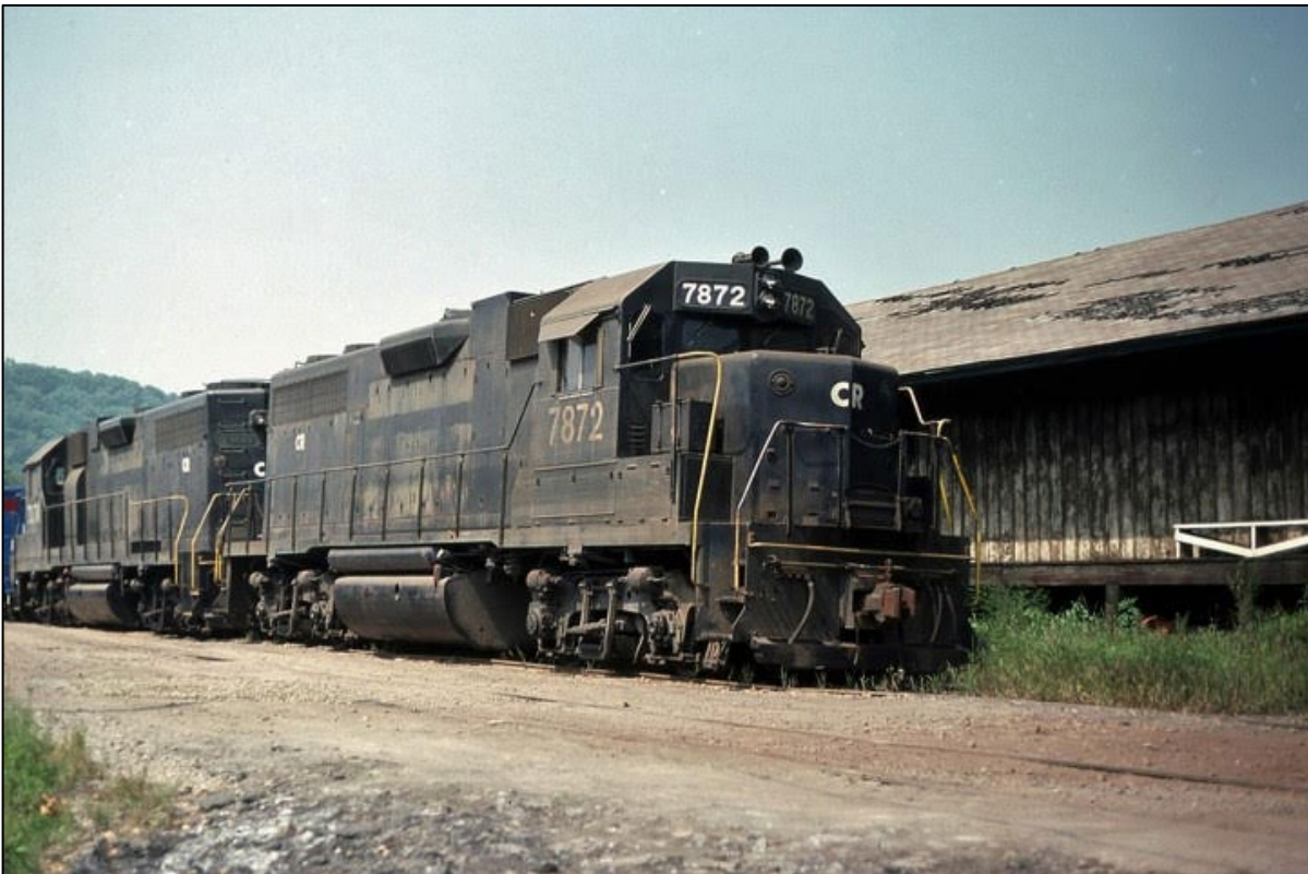
Conrail units at the Lisbon Station. September 1977.