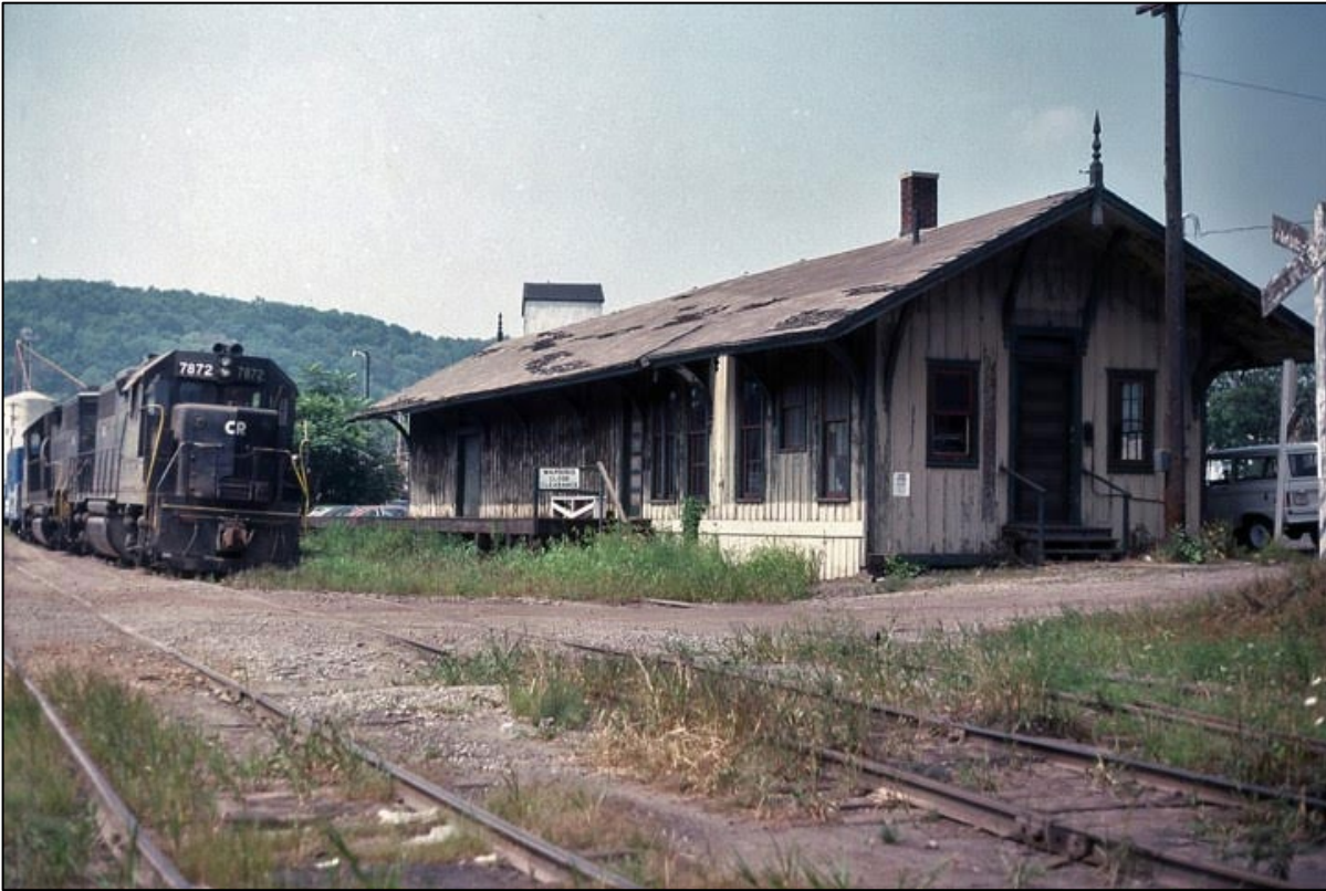
Conrail units at the Lisbon Station. September 1977.