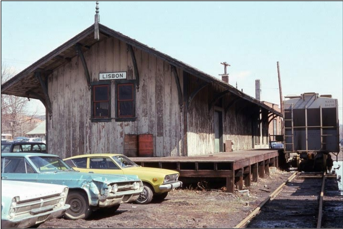
Another view of Lisbon Station looking east. March 1976.