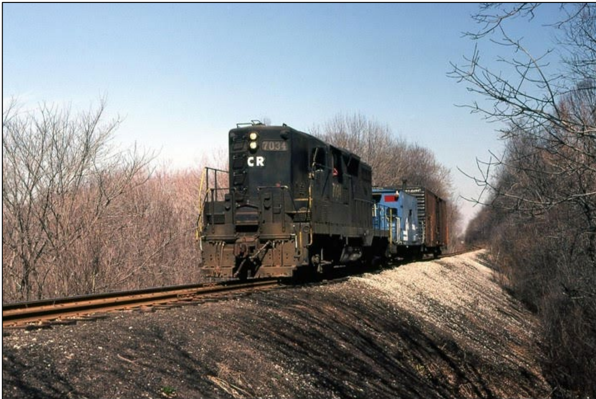
Another Conrail train going south to the food warehouse in Austintown, Oh. The location is in Mineral Ridge, Oh. between Depot St. and Countyline Rd. May 1981.