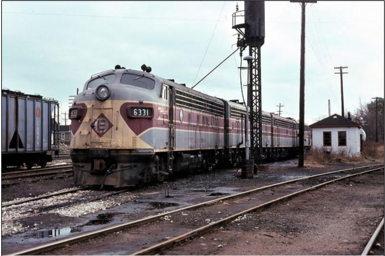
These are the units for the next train to Lisbon. Niles, Oh. November 1974.