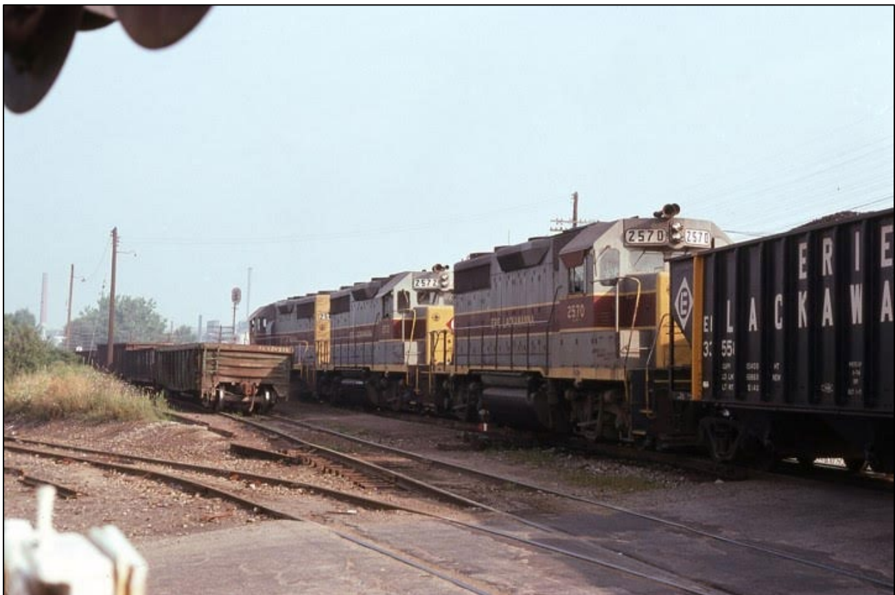
Three Erie-Lackawanna units are pulling a train of Lisbon-loaded coal out of the Niles, Oh. Yard. August 1974.