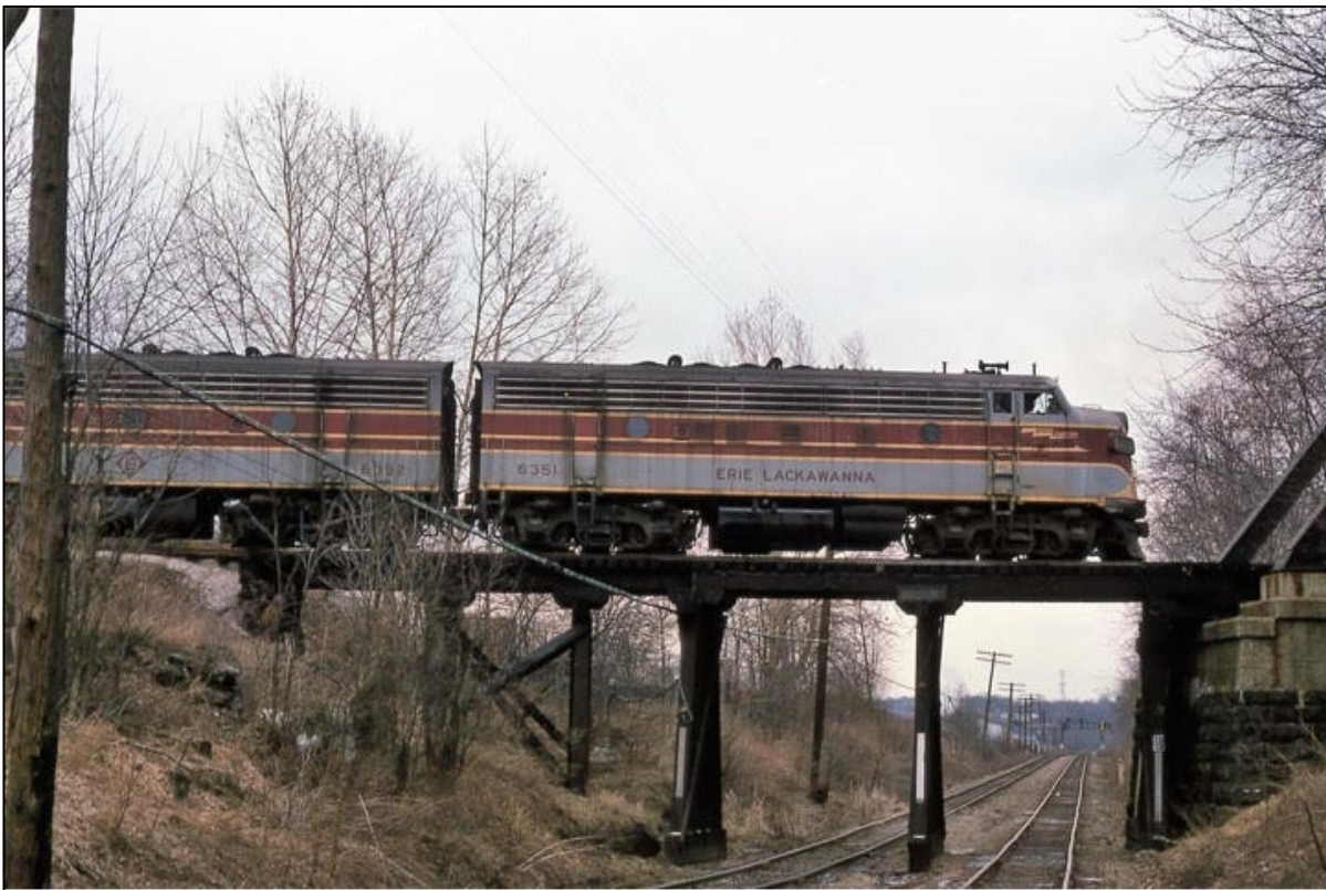
This was a A-B-B-A set of Erie-Lackawanna F7's leaving Niles, Oh. for Lisbon. The train is crossing over a Penn Central track before crossing the Mahoning River. April 1974.