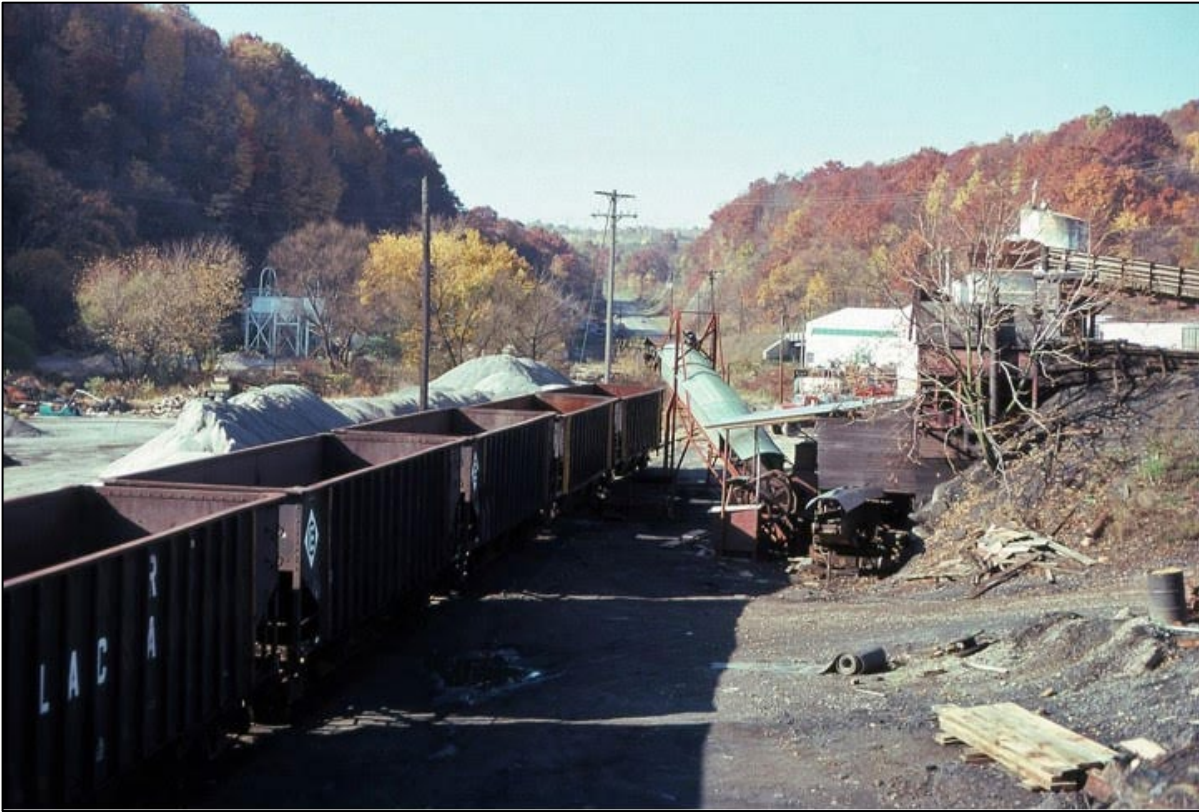
Overview of the loading process. October 1974. Lisbon, Oh.