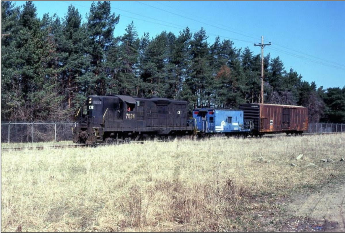
The southbound Conrail train is delivering frozen foods to a food warehouse in Austintown, Oh. The location is at Ohltown-McDonald Rd in Mineral Ridge, Oh. May 1981.